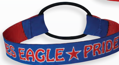
Elite Wristband BW-AE w/ elastic loop