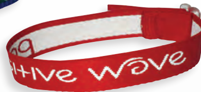
Premium Wristband BWX w/ slide closure